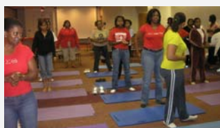
Sorors from CAAC prepare for Pilates.